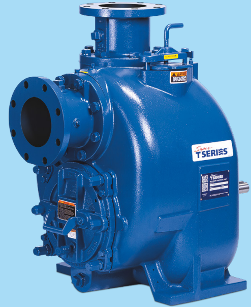
Shown with Optional Suction and Discharge Spool Flanges (Available in ASA or DIN Standard Sizes).

150 mm DIN 2527 – PN 16 (Specify Model T6B60S-B /FM).