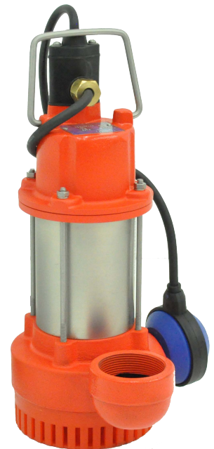
SE2N3-E.5 115/1 W