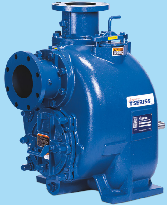
Shown with Optional Suction and Discharge Spool Flanges (Available in ASA or DIN Standard Sizes).

Gray Iron 30 Suction and Discharge Spool Flanges: 6" ASA (Specify Model T6A61S-B /F) 150 mm DIN 2527 – PN 16 (Specify Model T6A61S-B /FM).