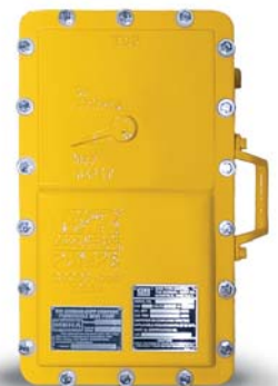
MSHA submersibles at work.