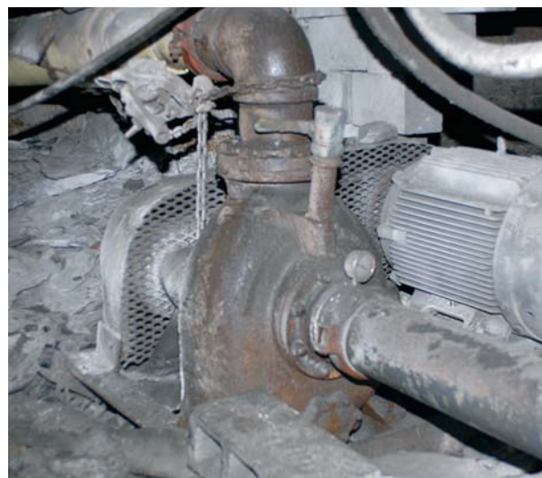
Self-priming centrifugal pump in a mine.

They are also available to offer suggestions on maintaining your equipment for maximum pumping performance for years of service.