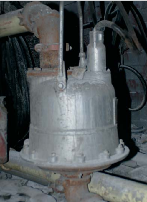
In-line staged submersible pump in a coal mine.

Whether it's a copper mine in Montana, a coal mine in Kentucky or a gold mine in Alaska, you'll find Gorman-Rupp pumps working reliably day after day, week after week, and year after year, to keep mine operations running smoothly.