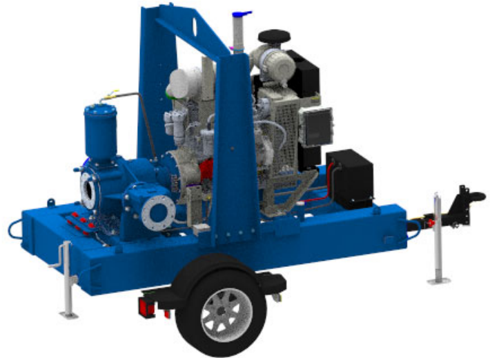
SHOWN WITH OPTIONAL WHEEL KIT